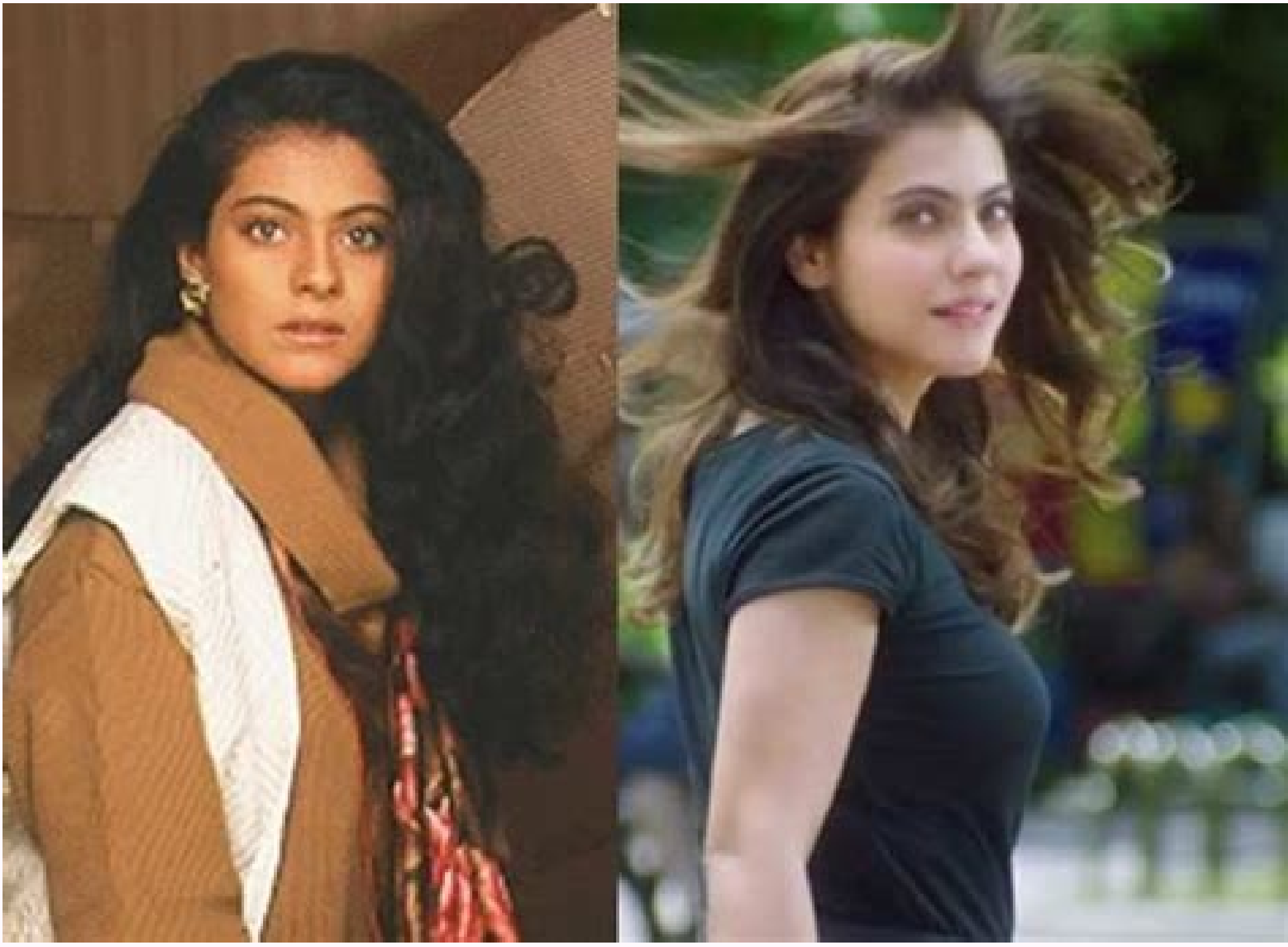
Baazigar hindi movie mp3 songs free download songs.pk.