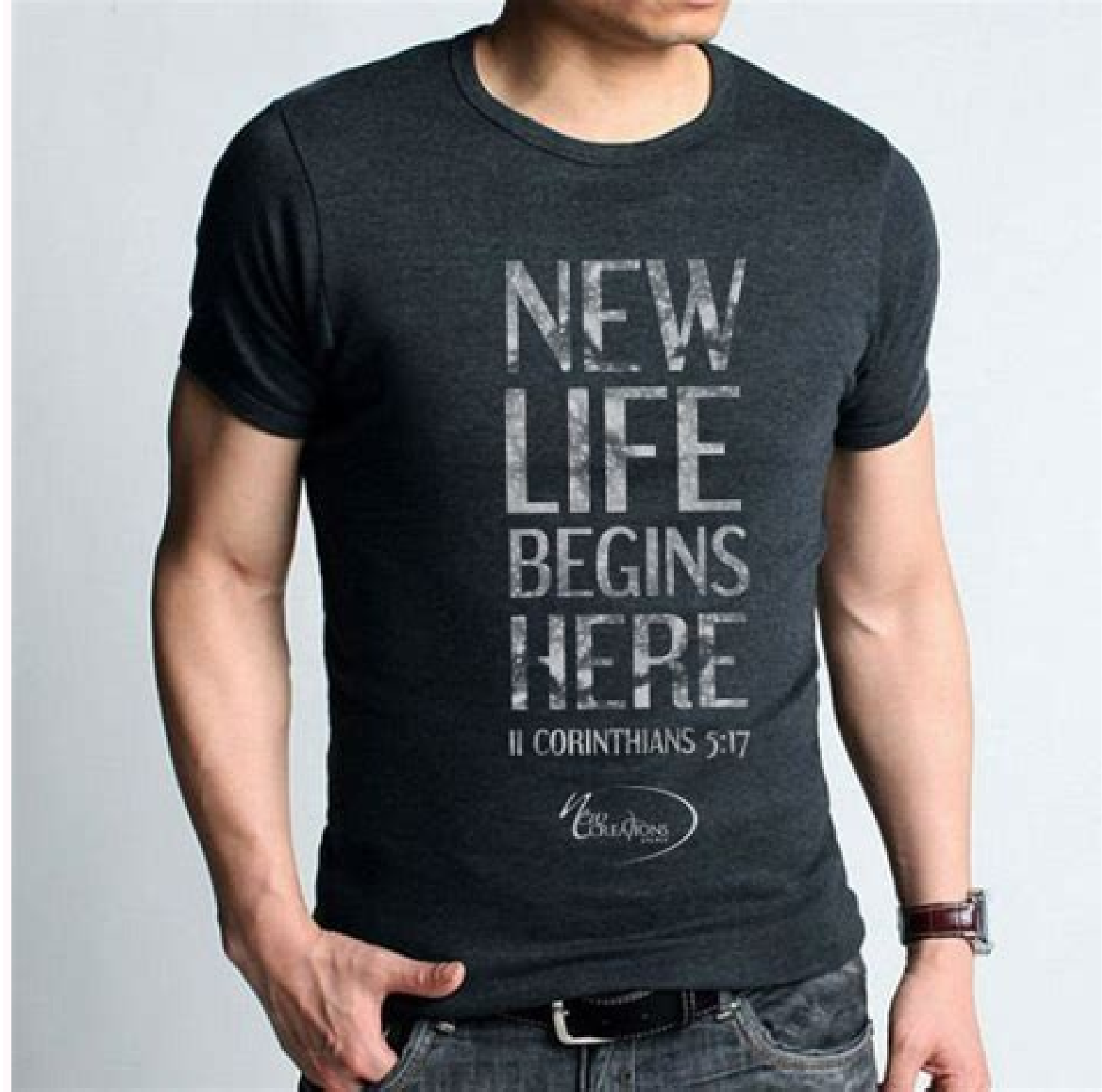
Anvil t-shirt size guide.