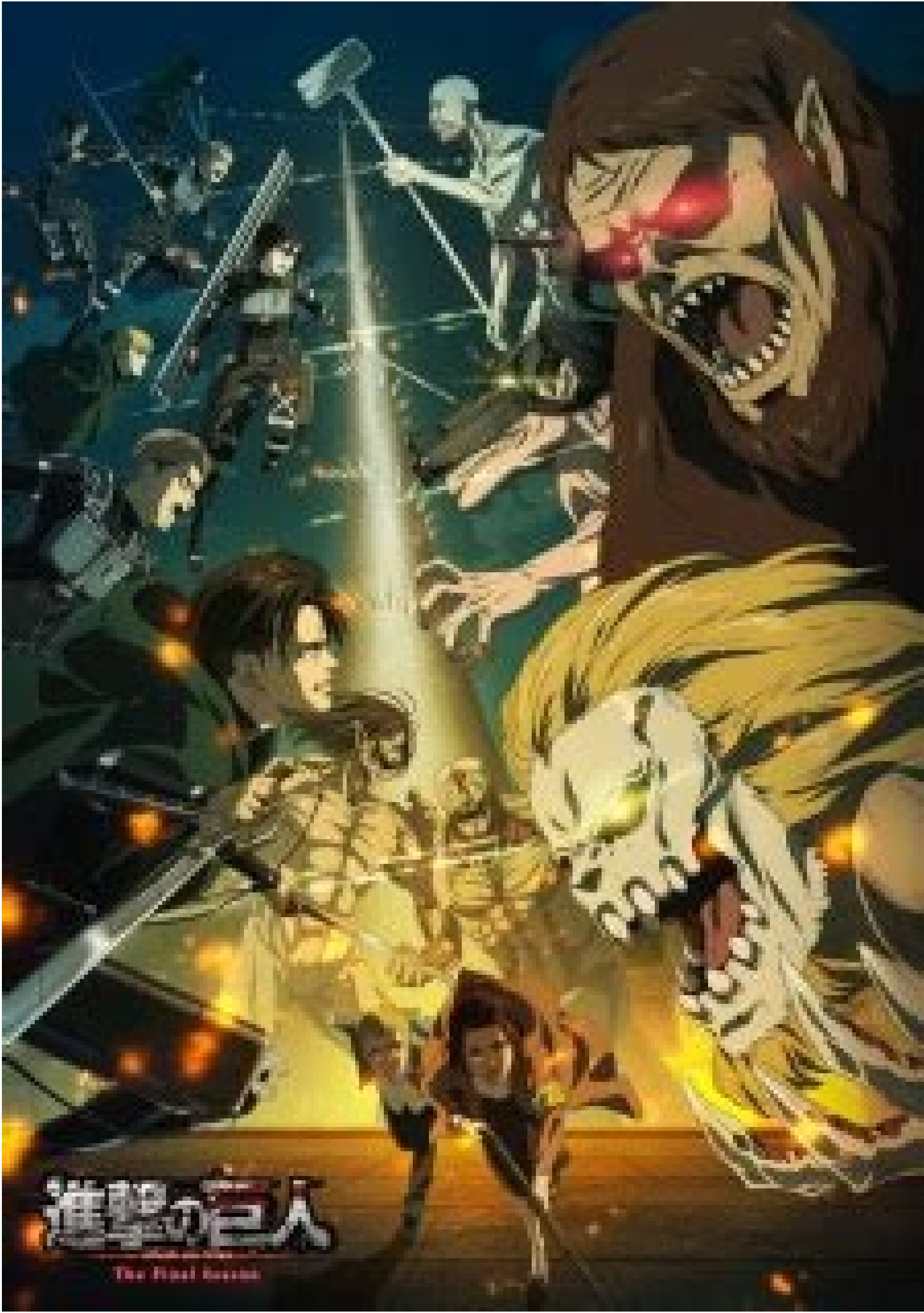
Is attack on titan season 4 getting a dub. Where is attack on titan season 4. Is attack on titan cancelled. Will attack on titan have a season 4. Will season 4 of attack on titan be the last.